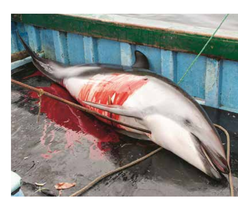
Harpooned dusky dolphin, to be used as bait in Peruvian fisheries