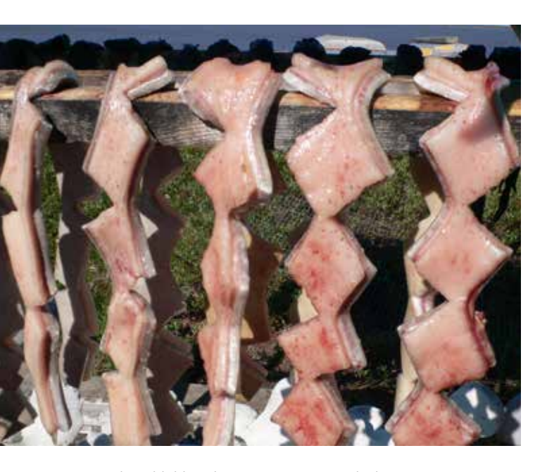
Beluga blubber drying at Point Lay, Alaska

(e.g., 2007, when the number of animals killed peaked at 270), annual kill rates have been up to 3.6 times the recommended level (Environmental Investigation Agency 2014, Allen & Angliss 2010). In the EBS, the number of whales killed in subsistence hunts has risen since the 1990s from an average of 130 during 1994–1998 to 193 during 2005–2009 (Environmental Investigation Agency 2014). The US Marine Mammal Commission (MMC) has raised concerns over the recent failure of the US to include struck and lost data for subsistence hunts in Alaska (MMC 2018).