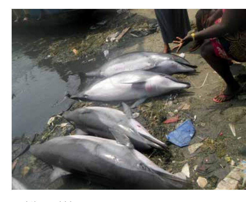
Dead Clymene dolphins

The exploitation of small cetaceans for food and, to some extent, for medicinal use was reported to occur on a minor scale during the 1990s despite such use violating national laws (Cosentino & Fisher 2016). To avoid being caught engaging in an illegal act, fishers dumped carcasses at sea or buried them on the beach (Van Waerebeek et al. 2000). Today, there is a limited trade in dolphin carcasses (many of them bycaught in shark and barracuda fisheries) for food and medicinal treatments (Leeney et al. 2015). In 2015, an entire carcass sold for US$6. The expert flensing skills exhibited by locals suggests that cetacean landings are common (Van Waerebeek et al. 2003). Indeed, 59 per cent of fishers interviewed (n=79) admitted to eating dolphin meat (Leeney et al. 2015).