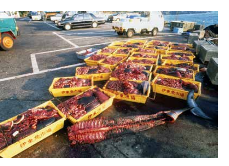
Body parts of small cetaceans, Japan

Dall's porpoise (Phocoenoides dalli, dalli- and truei-types), short-finned pilot whale (Globicephala macrorhynchus, northern and southern forms), Risso's dolphin (Grampus griseus), Pacific whitesided dolphin (Lagenorhynchus obliquidens), false killer whale (Pseudorca crassidens), pantropical spotted dolphin (Stenella attenuata), striped dolphin (Stenella coeruleoalba), common bottlenose dolphin (Tursiops truncatus), Baird's beaked whale (Berardius bairdii), rough-toothed dolphin (Steno bredanensis), melon-headed whale (Peponocephala electra), Hubbs' beaked whale (Mesoplodon carlhubbsi), ginkgo-toothed beaked whale (Mesoplodon ginkodens), Indo-Pacific bottlenose dolphin (Tursiops aduncus), pygmy sperm whale (Kogia breviceps), dwarf sperm whale (Kogia sima), Northern right whale dolphin (Lissodelphis borealis), orca (Orcinus orca) Numbers killed: less than 3,000 a year; after a constant decline from 46,000 in 1993 Type of hunt: directed hunts (acoustic drive hunts, harpoons, spears, knives)