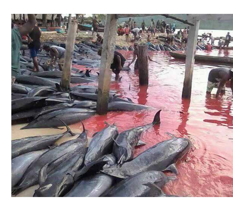
Dolphin hunt, Solomon Islands

The value of dolphin teeth increased from US$0.14/ tooth in 2004 to $0.70/tooth in 2013, providing villagers more incentive to hunt (Oremus et al. 2015). In 2013, the IWC Scientific Committee expressed concern regarding the potential depletion of local populations, given the scale of the recent (and historical) catches (IWC SC 2013, p. 67). Furthermore, DNA analysis has revealed the limited connectivity of local bottlenose dolphin populations and, consequently, a low likelihood for repopulation after offtakes if a local population is extirpated (Oremus & Garrigue 2015).